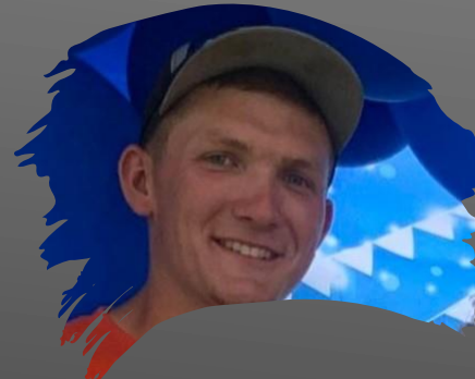
Nathan Berry Tires